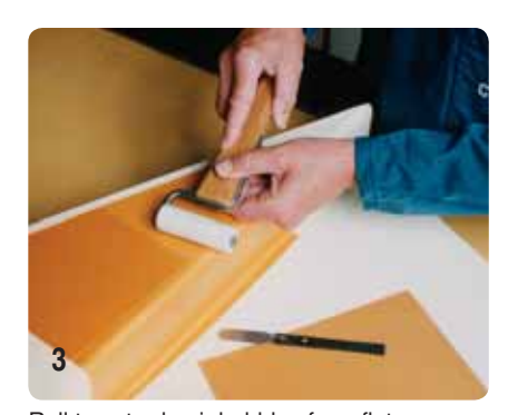
Roll to extrude air bubbles for a flat, even surface.