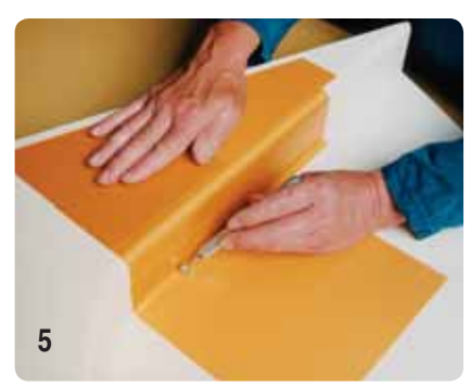
Consolidation of corners using filleting tools.