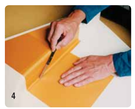
Accurately fitting subsequent pieces.